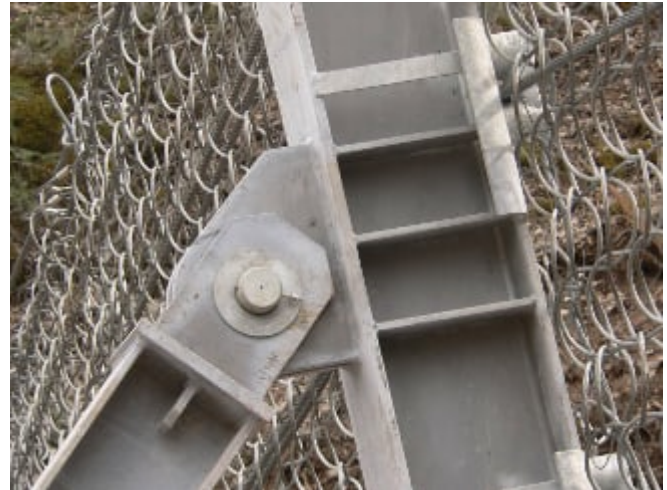
The hinge connection between the primary upright and the support brace, in this case made with a 70 mm pin.

Unique to Trumer systems is the Lambda-Frame that eliminates the need for upstream retaining ropes while at the same time provides very sturdy support to the net and bearing ropes which minimizes the reduction of net height during an event and the elongation of the system. Another large benefit is that the system can be installed at topographically unconfined sites.