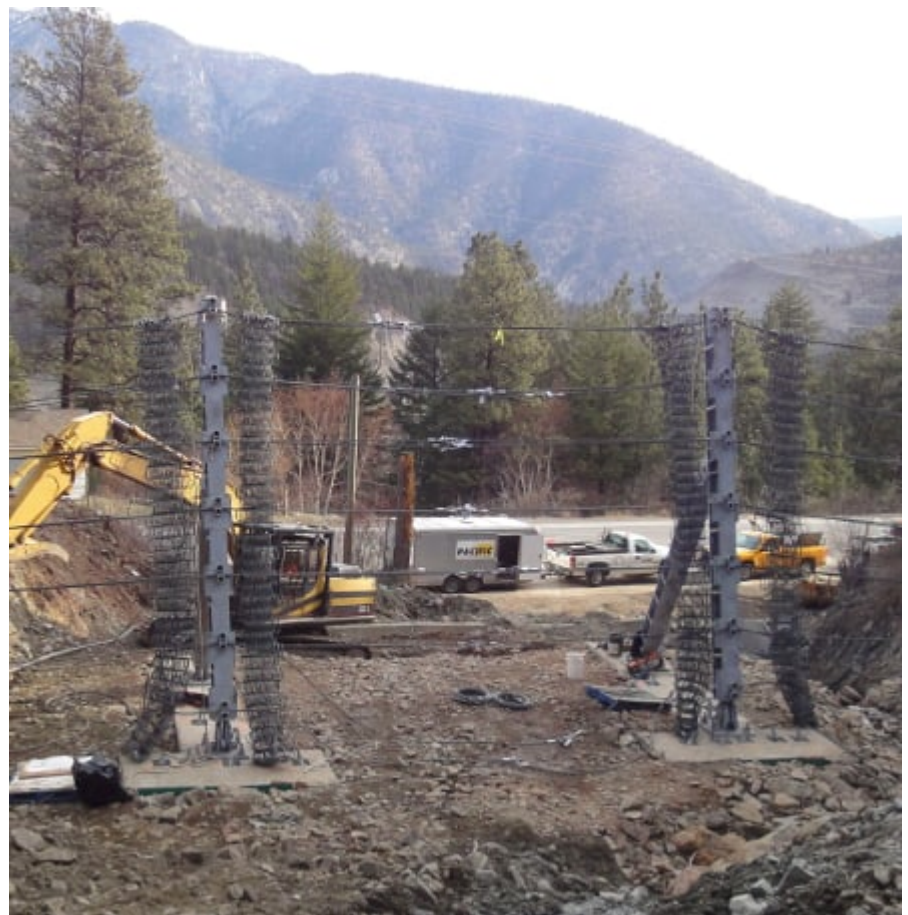
The Omega-Net packages allow for quick installation using no shackles to connect the bearing ropes. Once the bearing ropes are tensioned, the nets open like a curtain.

All steel components are hot-dipped galvanized and wire ropes are offered in both heavily galvanized as well as Zn-Al galvanization in the highest class.