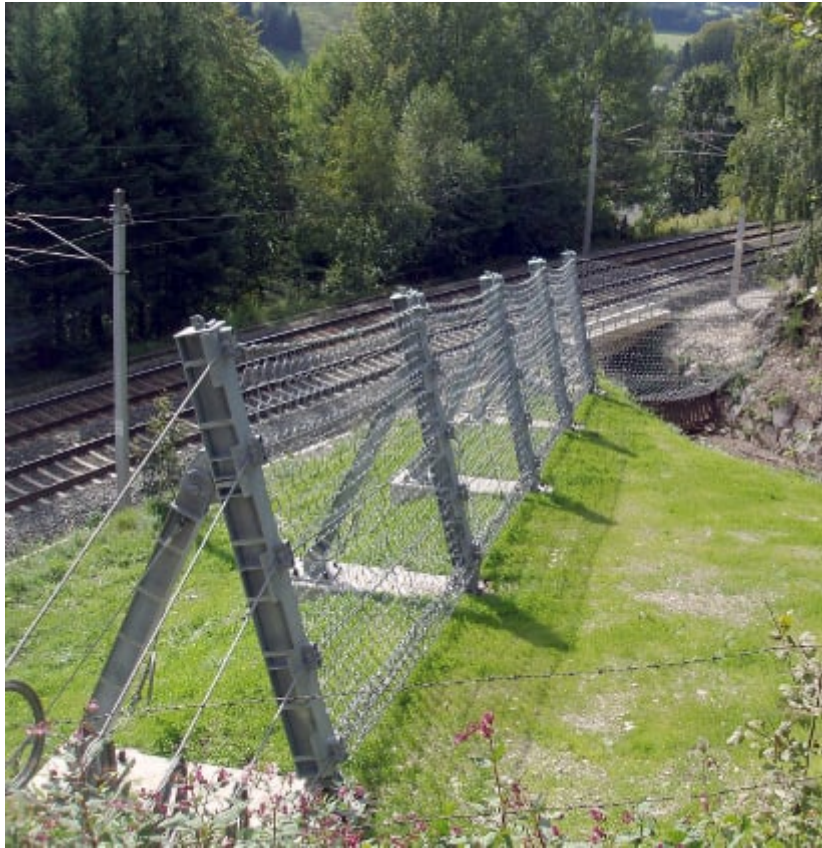
In this example, a 4 m tall debris flow system is used to protect a railway in a partially unconfined deposition area.