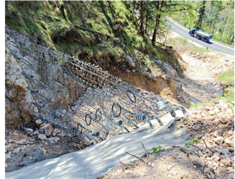
For narrow gullies, no posts are required. The net structure is hung on transverse bearing ropes that are fitted with energy dissipating brake elements. Under ideal circumstances, the gully is bedrock controlled. In unconsolidated material, care must be taken that proper anchoring is available which may sometimes require lateral foundations.

Flexible net systems are useful tools for dewatering saturated flows.