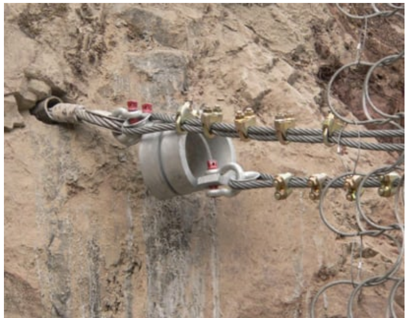
Wire rope anchors can be used to provide flexible anchorage. All connections are completed using high strength shackles and heavy-duty round thimbles for ease of installation and maintenance.

A variety of anchor systems can be used including standard bar anchors, wire rope anchors or anchor block foundations. These connection points can also be fitted with monitoring equipment or triggers for alarms.