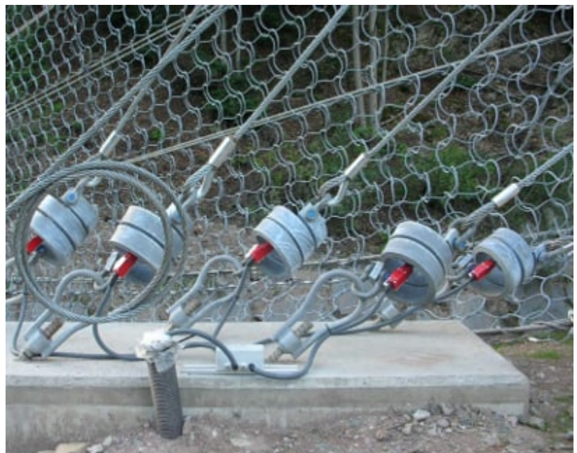
Where there is no bedrock available for anchoring bearing ropes, a concrete foundation with tie-back anchors can be used. Also note, the alarm triggers installed on the brake elements.