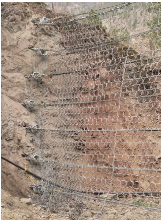
Multiple bearing ropes are used to ensure that the structure can withstand the static loading and dynamic impacts over the entire height of the structure.

To help dissipate energy during dynamic loading of the systems, special brake elements are used that plastically deform. The brake elements are found only at anchor points, at the perimeter of the system for ease of installation and maintenance.