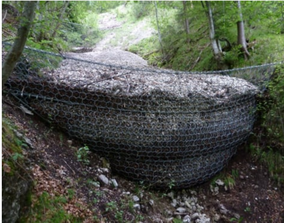
Depending on the nature of debris flow, varying mesh sizes can be used to filter out the desired fraction of debris. In this example, a fine mesh has been applied to the primary net structure to help retain the smaller particles.

The application of flexible net systems to debris flow mitigation is similar to that of shallow landslides in that each system is designed for a specific site based on the local geotechnical and geomorphological characteristics, as well as the anticipated characteristics of the flow itself. Thus, debris flow systems are better suited for nuisance sites where information from past events can be collected.