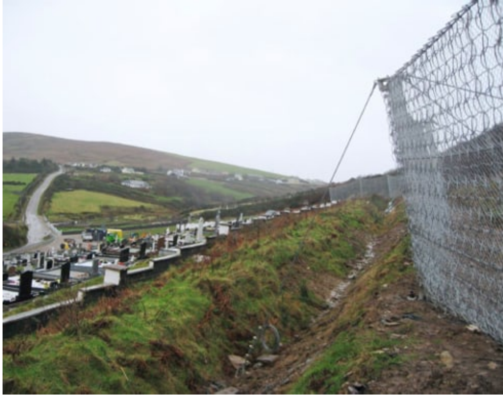
A catchment fence with downslope drainage installed to protect a cemetery from shallow landslides.

The utility of flexible net systems for mitigating the effects of shallow landslides, earth slumps and mudflows has long been known from incidental events that occur along side rockfall events, into traditional catchment fences. Yet it is only more recently that such systems are being specifically constructed for this purpose.