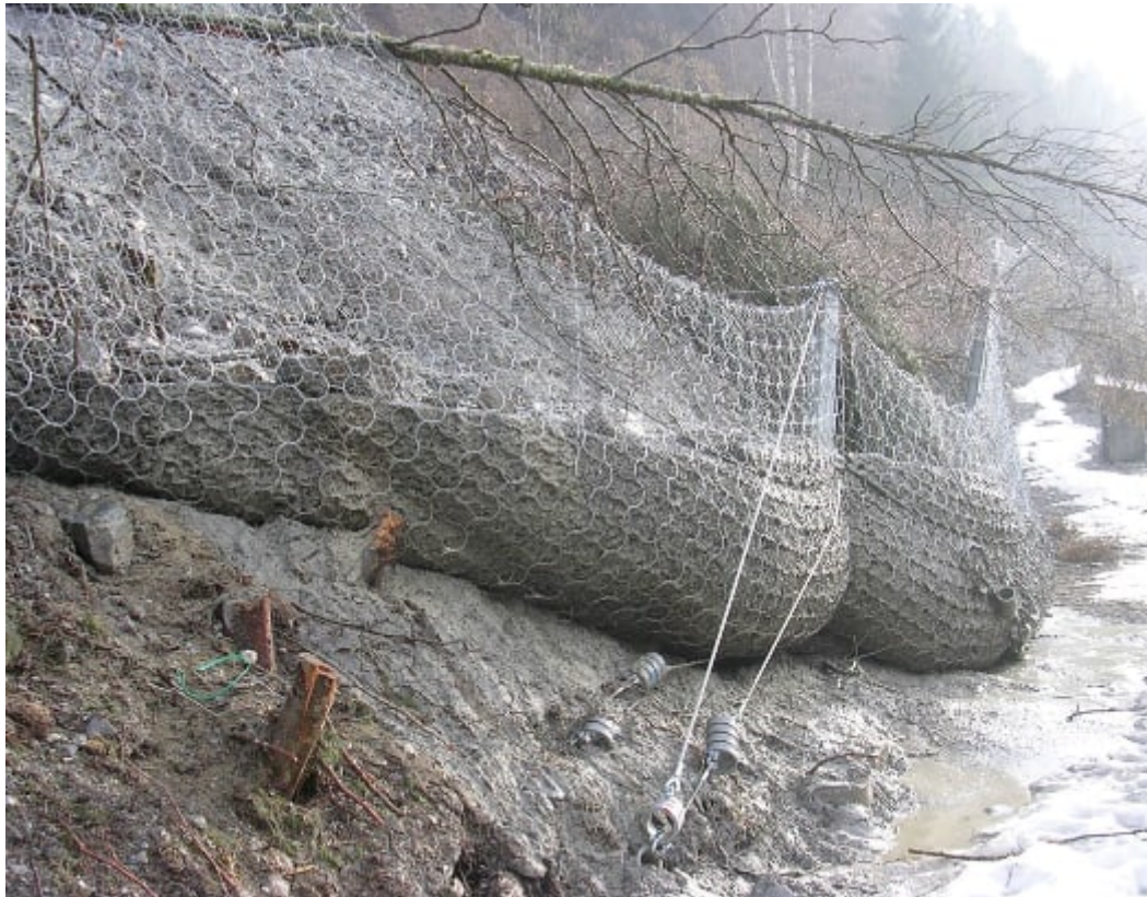
Following an event, the material can either be removed through access from behind the system or by opening the nets in the affected sections. It is not necessary to dismantle the entire system and most components can be re-used.

In general, there are several advantages of flexible net systems over more traditional mitigation measures: