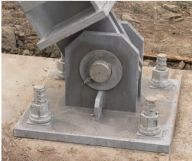
The hinged base plates for the posts and braces are connected to the foundation using short bar anchors or bolts.

Debris flow systems share many of the same advantages over traditional mitigation structures as the shallow landside systems: