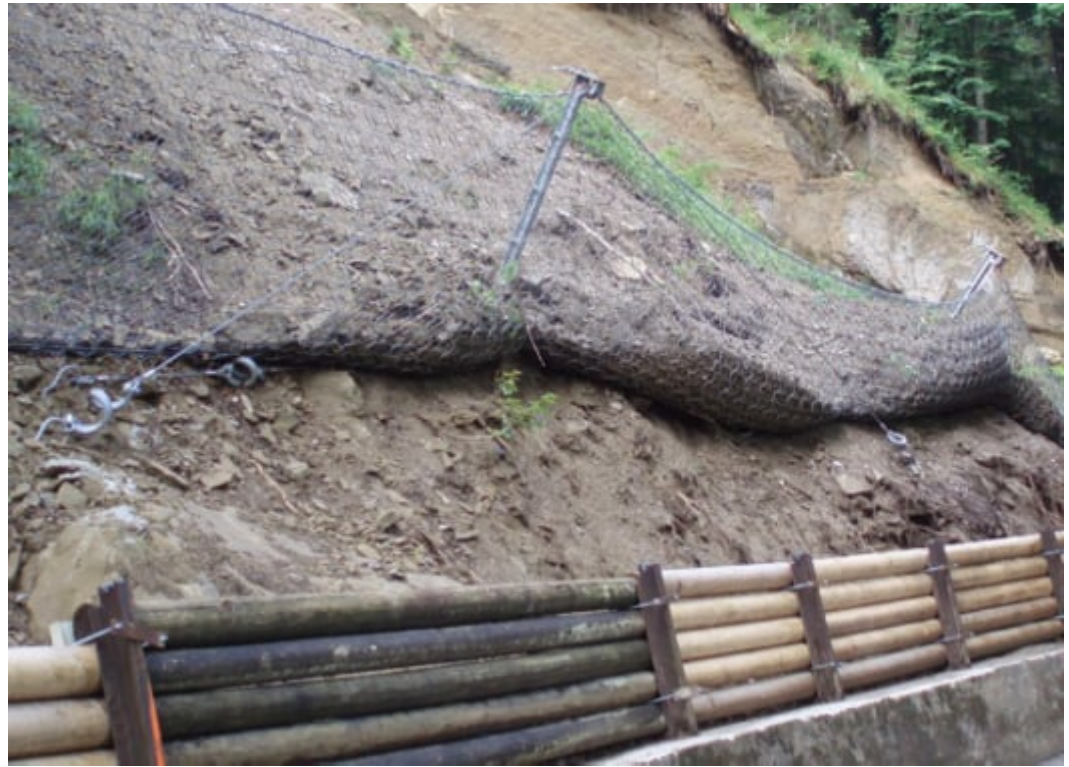
Shallow landslide barriers can be installed on steep slopes where stabilization methods would require more invasive techniques and often be too costly or impractical.

Each system is designed based on information provided by the field engineer regarding the physical characteristics of the material, the site geometry and the nature of the mass wasting event. This evaluation on a site-to-site basis is the only way to arrive at a technically correct solution and safe system.