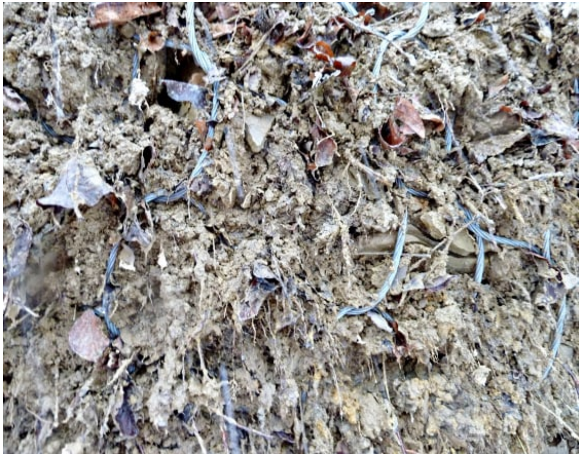
After the initial dynamic impact, material is retained by the cable nets and allowed to freely drain.

Furthermore, since the primary interception structure of the systems is a mesh or net, water can drain freely from the slope while the material is contained. This means that drainage systems downslope of the catchment fence will not be clogged with debris, which is often a secondary affect of shallow landslides that has large consequences for infrastructure and general maintenance.