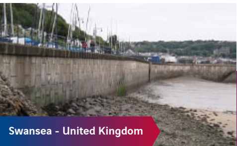
Swansea - United Kingdom

Roads, motorways and railways, are often constructed along the seacoast just above the maximum high tide level. When the seacoast is so narrow that new construction or widening of existing communication link encroach on the sea, retaining structures are required and the Reinforced Earth® technique is perfectly adapted to such applications.