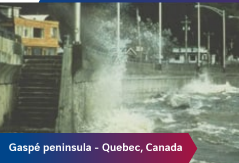
Gaspé peninsula - Quebec, Canada