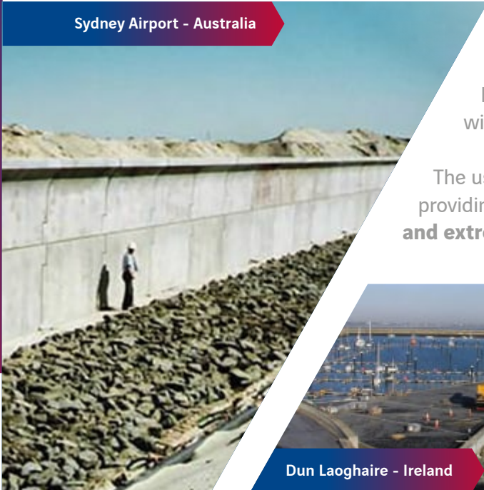
Sydney Airport - Australia

The use of large size Z-shaped panels allows for rapid construction , providing additional protection against adverse weather conditions and extreme tidal fluctuations .