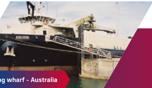
Bing Bong wharf - Australia

Reinforced Earth® marine structures have generally been constructed under dry condition or during periods of low tides. Experience has proven that structures in sheltered sites or harbors can be submerged during the initial stages of construction without any damage to wall construction.