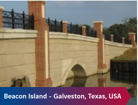
Beacon Island - Galveston, Texas, USA

Reinforced Earth® marine structures have generally been constructed under dry condition or during periods of low tides. Experience has proven that structures in sheltered sites or harbors can be submerged during the initial stages of construction without any damage to wall construction.