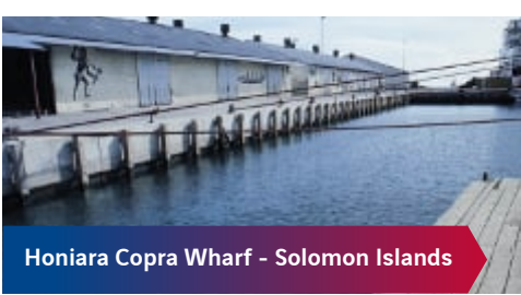
Honiara Copra Wharf - Solomon Islands

The Reinforced Earth® method is well known to combine strong technical and operational benefits with aesthetic properties while providing speed of construction and substantial cost savings. Therefore it is an excellent solution for the construction of marinas, providing the perfect answer to owners, local communities and users .