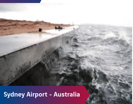
Sydney Airport - Australia

The Reinforced Earth® technique has been used for around 60 years to build marines structures either on coastlines or in harbors. The design and construction materials used in marine environments must allow for the risks associated with this special environment. Performance characteristics that have made Reinforced Earth® solution universally accepted in traditional civil engineering applications can be easily adapted to the requirements of marine projects.