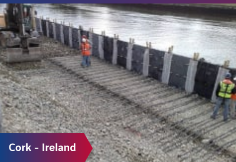
Cork - Ireland