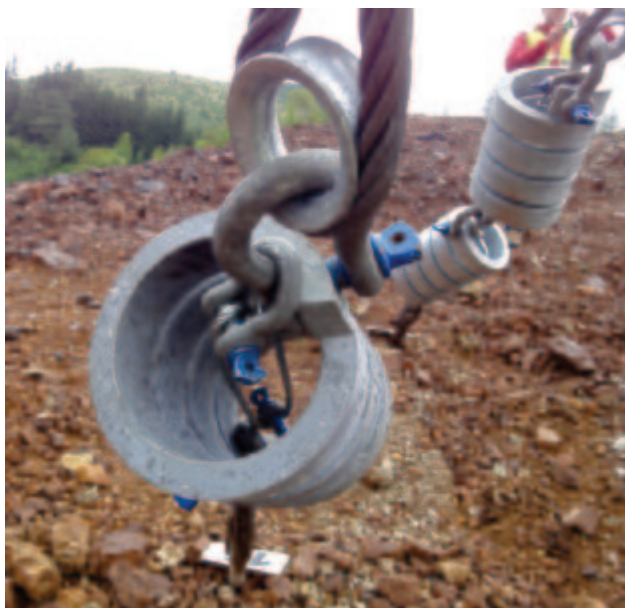
Several adaptations are made to a standard catchment fence to reduce maintenance such as the brake locks pictured above.