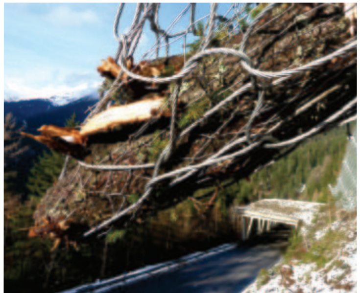
An example of a tree stem impact on a rockfall catchment fence.