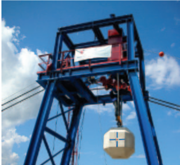
Tests following certification guidelines are carried out using standardized blocks to simulate impacts up to more than 5000 kJ.

Trumer offers solutions based on decades of experience - both from testing and practical application - protecting life, urban areas and infrastructure from natural and anthropogenic induced hazards.