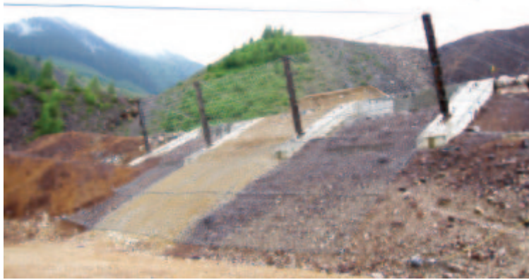
Before photo of a 3000 kJ hybrid test. The system consists of 5 m high posts with 12 m of Omega-Net.

Attenuators and hybrid rockfall fences by Trumer can absorb high amounts of energy while at the same time place debris at a more convenient location for maintenance.