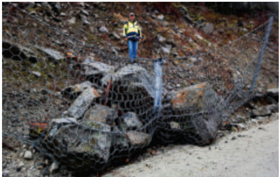
Two examples of hinged rockfall catchment fences impacted at and surrounding a post. Posts by Trumer are robust and can withstand direct impacts without compromising the systems integrity.