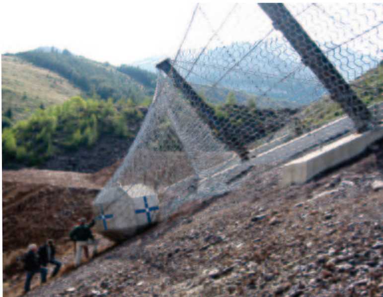
A completed Maximum Energy Level test for a 5000 kJ rockfall catchment fence.

At Trumer, it is not enough that a system simply passes the certification process where many components may be severely damaged but may still pass the certification process (as long as the test block is captured). This is because we believe that to design a system to pass an idealized event is not the same as to design a system to perform well under natural conditions. We expect more out of our systems and go above and beyond certification requirements to ensure that every primary component of the system is in a safe state following a Maximum Energy Level test, thus the motto: SAFETY WITHOUT COMPROMISE.