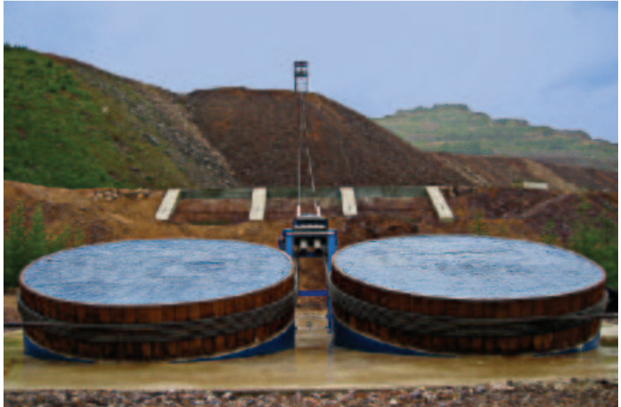
The inclined test facility from Trumer is one of the largest and most modern in the world and can accommodate a large variety of types of fences as well as earth dams.

Trumer Schutzbauten has been at the forefront of the geohazard industry since the early 1990s, shortly there after developing proprietary systems now sold throughout the world. Our systems are the result of years of 1:1 scale testing at some of the most modern facilities. Combine this with real-world performance from systems installed across Europe, Scandinavia, Asia and Canada over the past two decades and you get rockfall catchment fences that have been fine tuned to be robust and reliable.