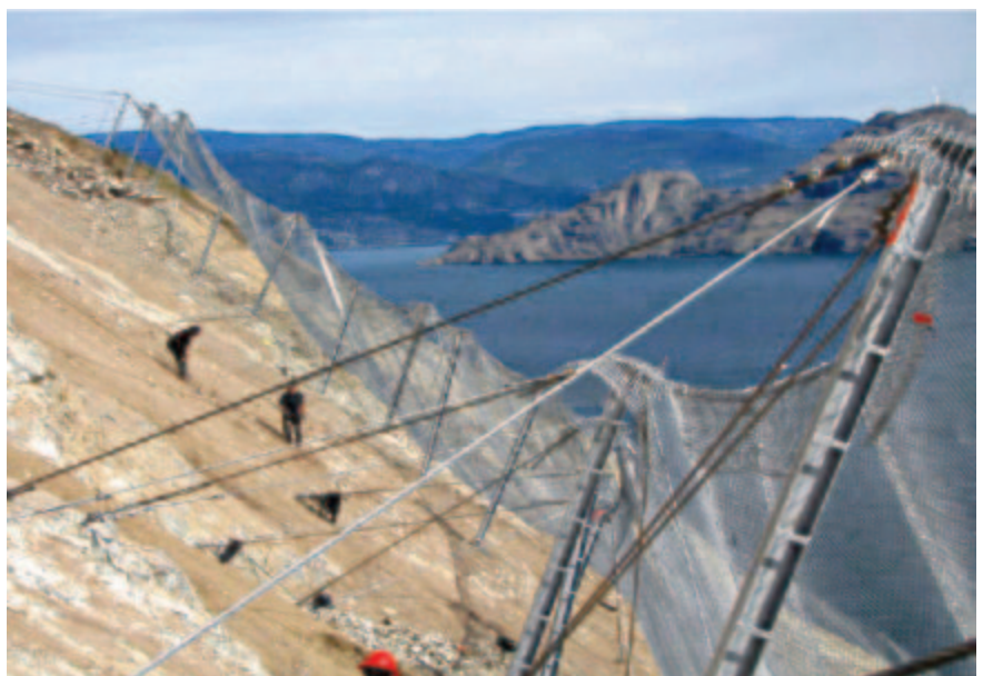
A lower energy attenuator system composed of High Performance Netting in combination with standard hinged posts and base plates.