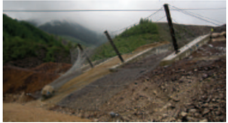
During the impact, the majority of the energy is absorbed during the initial contact with the upper section of the structure, but the projectile is allowed to progress through the system to the bottom portion of the net.

Hybrid and attenuator rockfall systems are those that absorb some or all of the energy of a rockfall but that allow the debris to move from an upper position to a lower position of the fence, thereby reducing the amount of effort for maintenance following an event.