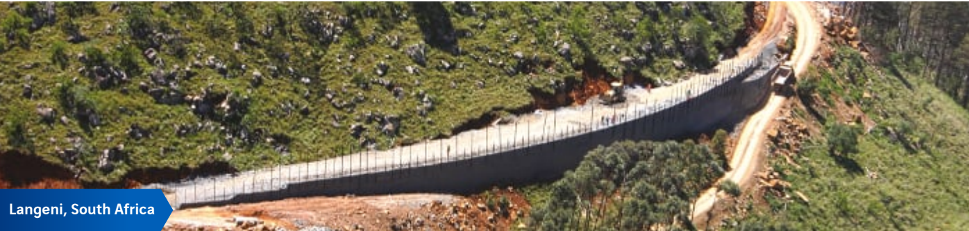
Langeni, South Africa

This wealth of expertise has led Geoquest to develop processes offering common advantages: