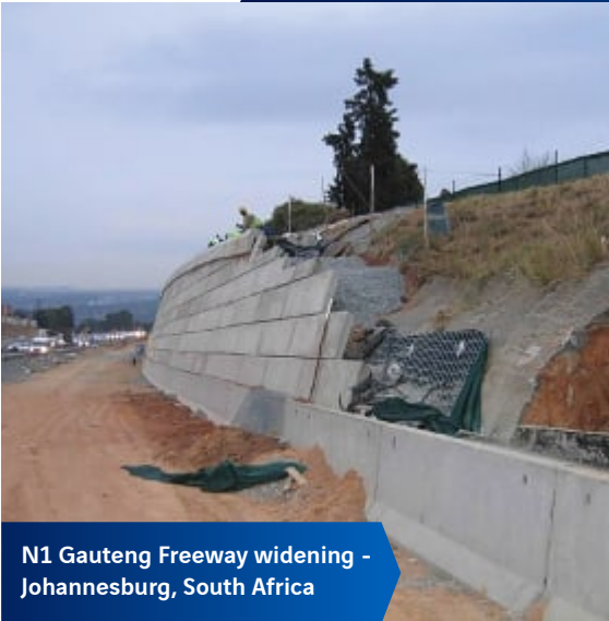
N1 Gauteng Freeway widening - Johannesburg, South Africa

Due to the increase of traffic, providing a widened of platform is often necessary. In restricted urban areas the construction of new ramps is often just in front of existing ramps. A standard retaining wall would have the drawback to partially dismantle the current ramp in order to build the new one. The TerraLink® system enables the construction of the new ramp while keeping in place the existing wall, maintaining traffic use for most of the construction time.