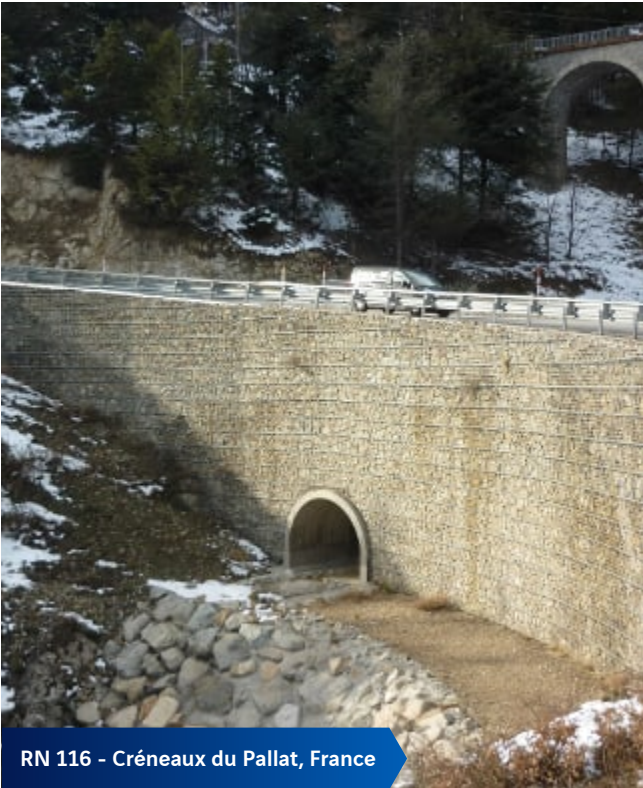
RN 116 - Créneaux du Pallat, France

As the world leader in mechanically stabilized earth , Geoquest has a presence in five continents, and benefits from both local and international expertise.