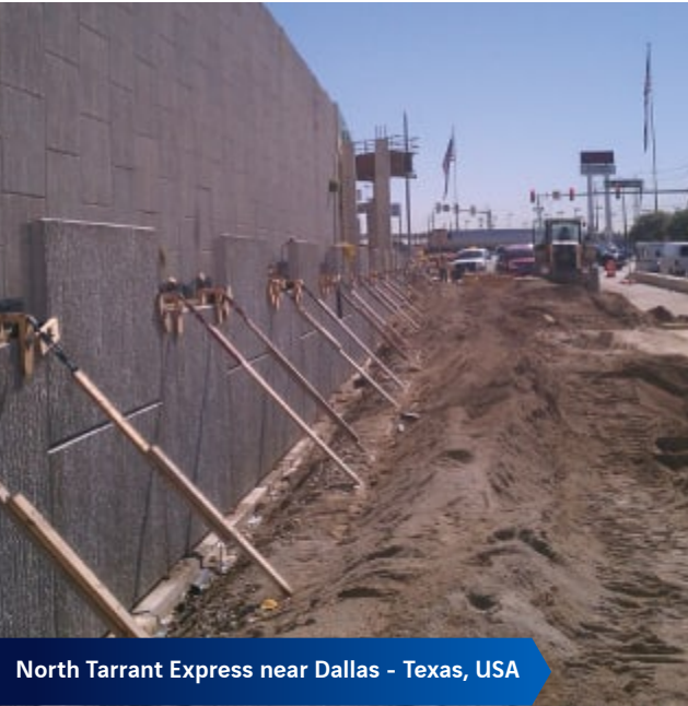
North Tarrant Express near Dallas - Texas, USA

The existing structure could be a soil nail wall, Reinforced Earth® wall or other retaining wall, or an existing natural feature such as sloped terrain or bedrock. Whatever its origin, a specific assessment is required to ensure that the existing structure is safe enough or needs evaluation of the consolidated works to support the new load configuration.