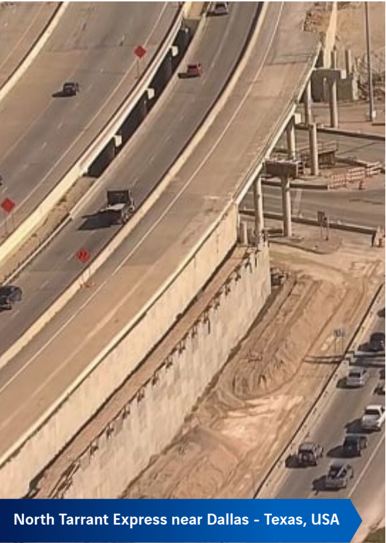
North Tarrant Express near Dallas - Texas, USA