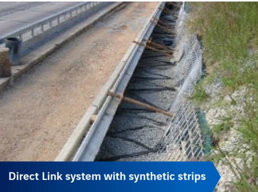
Direct Link system with synthetic strips