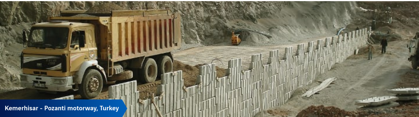
Kemerhisar - Pozanti motorway, Turkey